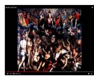
https://www.youtube.com/watch?v=UGGC8CLdZ4c Mozart, Requiem, Dies Irae TSSO, Macedonia Choir - 4/2006