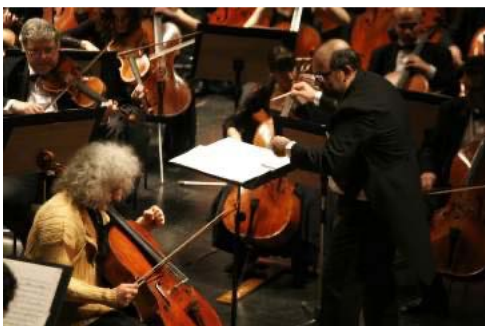
Mischa Maisky Dmitri Shostakovich: Cello Concerto No 1 TSSO, 3/2008