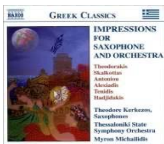
NAXOS Impressions for Saxophone and Orchestra Soloist: Theodore Kerkezos TSSO, 2007