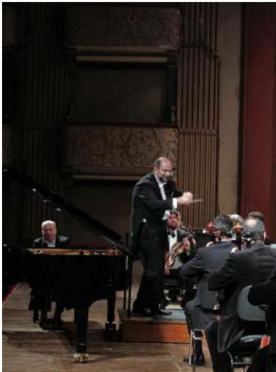
Aldo Ciccolini Sergei Rachmaninov: Piano Concerto No. 2 Teatro Verdi, Florence, TSSO, 11/2009