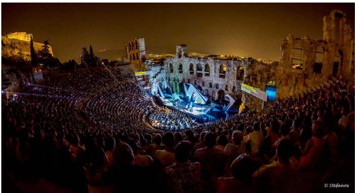
Myron Michailidis conducts Otello at Odeon Herodes Atticus Regie: Yannis Kokkos, GNO Production, 7/14