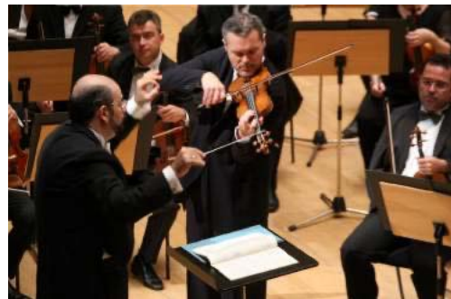
Vadim Repin Jean Sibelius: Violin Concerto TSSO, 9/2010