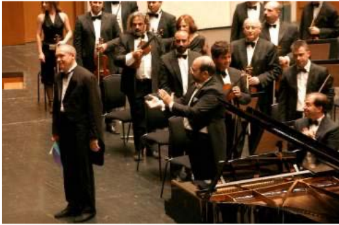
Ivo Pogorelič Sergei Rachmaninov: Piano Concerto No 2 TSSO, 2/2010