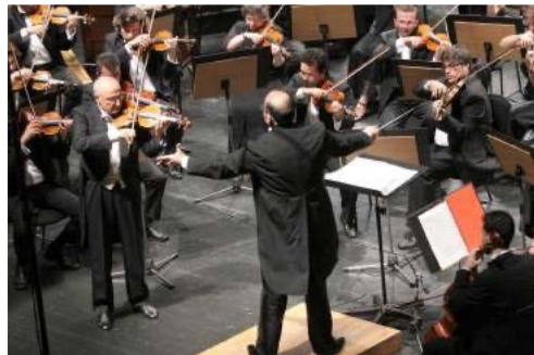
Salvatore Accardo Nicolò Paganini: Violin Concerto No 1 TSSO, 5/2007