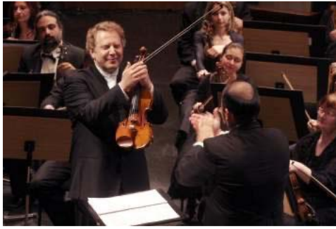
Shlomo Minz Édouard Lalo: Symphonie espagnole TSSO, 3/2005