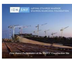
https://www.youtube.com/watch?v=KX1mu80b12E Holst, The Planets, Mars, Venus and Jupiter GNO, 6/2014