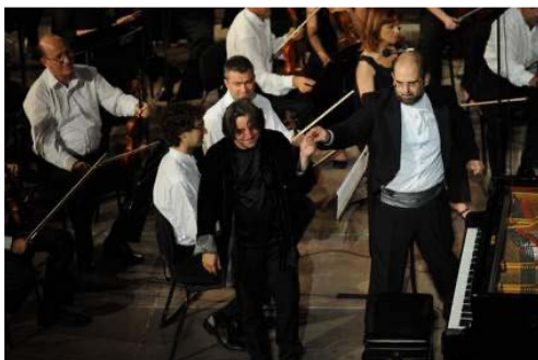
Fazıl Say George Gershwin: Rhapsody in Blue, I got rhythm Athens & Epidaurus Festival, TSSO, 6/2008