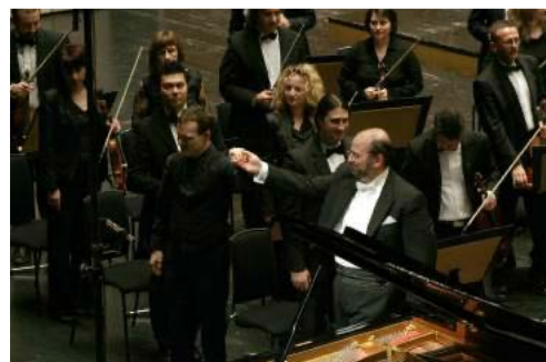
Lars Vogt Robert Schumann: Piano Concerto TSSO, 11/2008