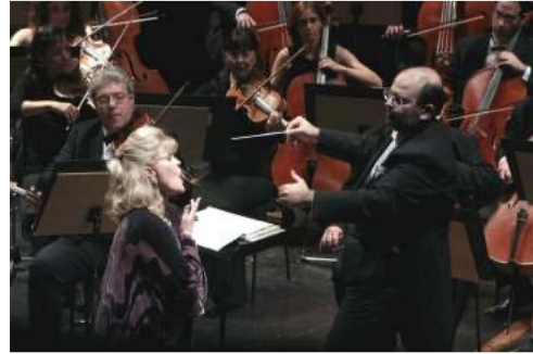
June Anderson Opera Gala TSSO, 11/2006