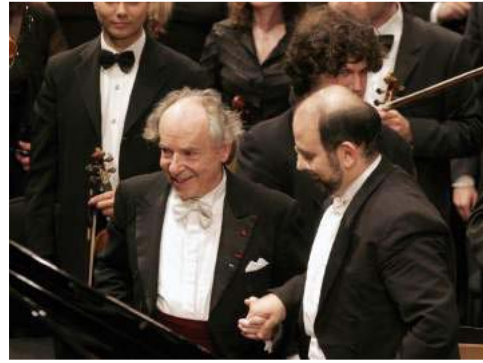
Paul Badura-Skoda Johannes Brahms: Piano Concerto No 1 TSSO, 4/2005