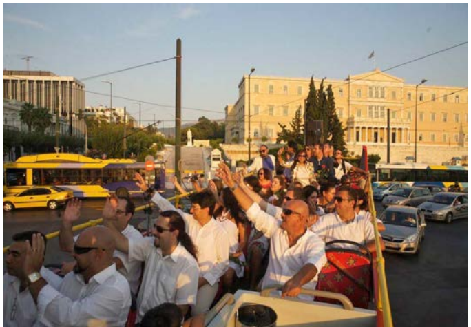
Various Openair and Educational Projects in selective places such as Ancient Theaters, Museums, Meat Markets and offering performances by the Lyrical Bus to familiarize the people with the classical music