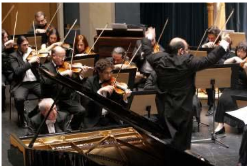
Aldo Ciccolini Sergei Rachmaninov: Piano Concerto No 2 TSSO, 5/2006