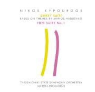
NAXOS Pizzetti, World Première Recordings TSSO, 2009