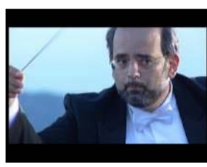
https://www.youtube.com/watch?v=HROsEpIgiKo Rachmaninoff, Symphony No. 2, Adagio TSSO, 9/2009