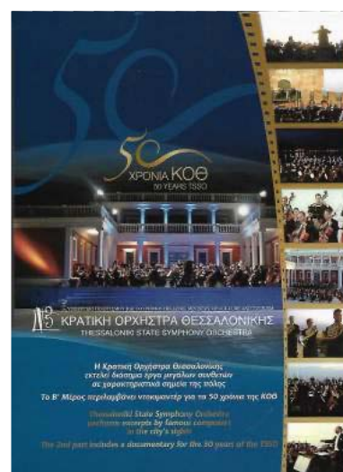
TSSO Editions Gala Concert for the 50 years of the TSSO